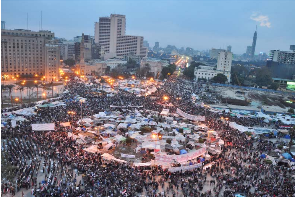
Over one million protestors demonstrate in Cairo's Tahrir Square on 9 February, 2011 http://commons.wikimedia.org/wiki/File:Tahrir_Square_-_February_9,_2011.png

In the spring of 2011, the world watched as revolutionary fervor swept the Middle East, from Tunisia, to Egypt, to Syria and beyond. Startling images captured by civilians on the scene were viewed by people around the world, courtesy of distribution via