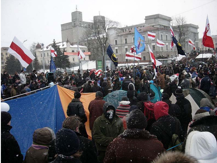
A 21 March 2006 demonstration held at October Square in Minsk after the Belarus president elections.

"Facebook and Twitter have their place in social change, but real revolutions take place in the street. One of the biggest obstacles in using social media for political change is that people need close personal connections in order to get them to take action – especially if that action is risky and difficult. Social media always comes with a catch: It is designed to do the very thing that isn't particularly helpful in a high-risk situation" (Rosenberg).