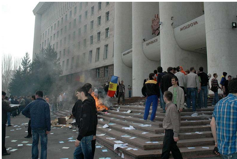
Protest riots in front of the Parliament of Moldova, 7 April 2009 http://en.wikipedia.org/wiki/File:Chisinau_riot_2009-04-07_01.jpg

The first widely-recognized use of social media as a tool of political revolution occurred in Moldova in 2009. Activists used Facebook, LiveJournal (an electronic diary service/social network), and Twitter to organize protests and bring attention to the political unrest in the former Soviet republic. Interestingly enough, during the protests, Russian-language Tweeters debated the role of social-networking tools in organiz-